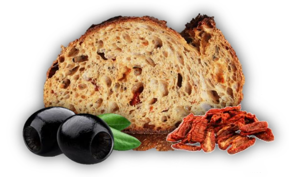
SUN DRIED & BLACK OLIVES: RS. 950 "Zesty and flavourful bread made with sundried tomatoes and olives, perfect for Mediterranean flair."