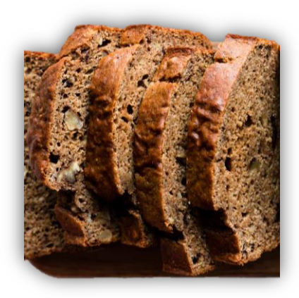
WHOLE WHEAT BANANA RS. 1300 "Moist, sweet bread made with whole wheat flour and ripe bananas. Healthy and delicious."

"Spicy and tangy bread made with chili and tomatoes, perfect for a bold kick"