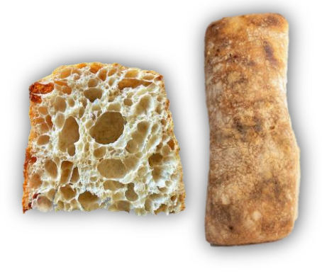
CIABATTA: RS. 650 (PACK OF 2) "Light and airy bread with a crisp crust and a chewy texture, perfect for sandwiches."

A tangy baguette with cranberry & walnuts. Crunchy outside, chewy inside. Perfect for cheese or jam.