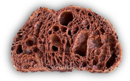
SOURDOUGH CHOCOLATE: RS. 950 "Sourdough chocolate bread is a unique and flavourful twist on classic sourdough bread, with a rich chocolatey taste."