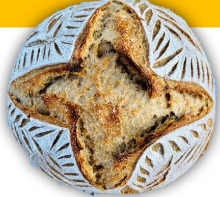
Pain de Campagne, Round Shaped Sourdough Country Loaf, Rs. 850, Its Flour, water and Salt only