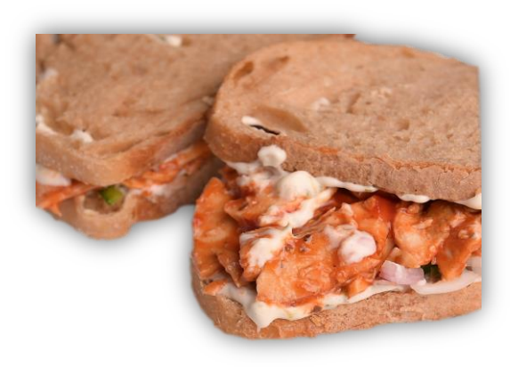
PLAIN ROASTED CHICKEN SANDWICH RS. 650

Jalapeño & cheese a spicy & cheesy twist to a crunchy cheese sandwich. Pairs well with this roasted chicken filling.