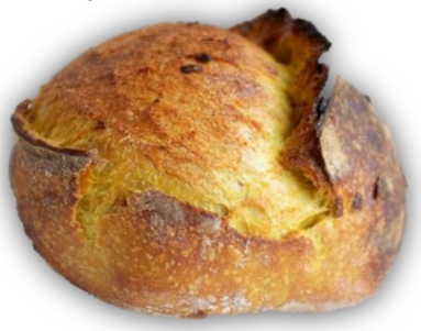
TURMERIC & ROASTED GARLIC: RS. 950 Vibrant and savory bread made with turmeric and roasted garlic, perfect for bold flavour."