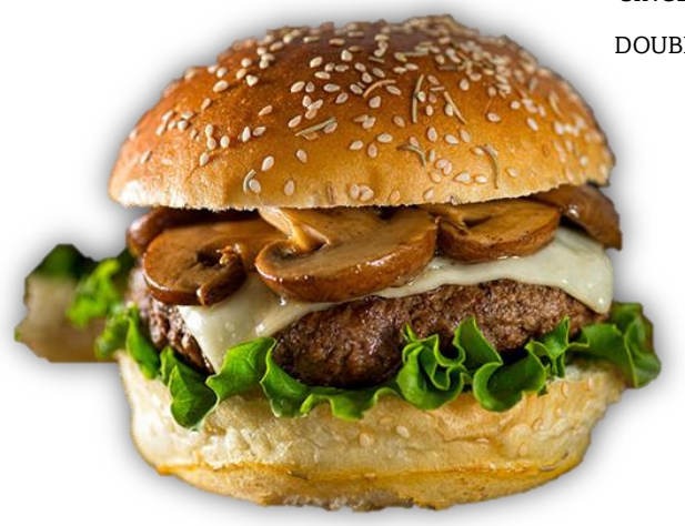
MUSHROOM BEEF BURGER

SINGLE PATTY 100G (BRIOCHE) RS. 700 DOUBLE PATTY 200G (BRIOCHE) RS. 900