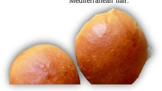
BRIOCHE BUN (PACK OF 4) RS. 750

Traditional sourdough Buns, best for the burger buns, soft, fluky and tangy. Enjoy with beef or chicken burger