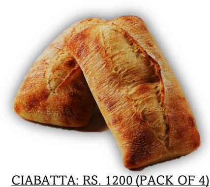
"a savoury, slightly spicy, Golden brown & crispy on the outside with a soft, fluffy interior".

"Dense, nutty bread made with buckwheat flour and sourdough starter."