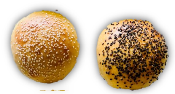
SOURDOUGH BUNS (PACK OF 4) RS. 650

Traditional sourdough Buns, best for the burger buns, soft, fluky and tangy. Enjoy with beef or chicken burger