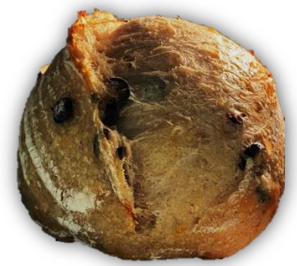
ROSEMARY, BLACK OLIVES: RS. 950 "Rosemary a strong taste with olives touch. Crispy exterior, fluffy interior. Complements any meal."