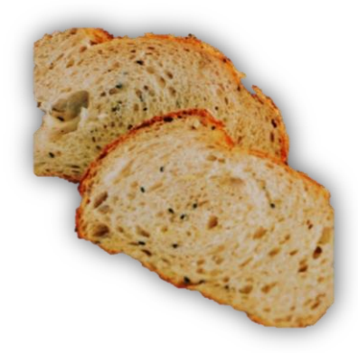
MULTI SEED: RS. 850 "Earthy and wholesome bread made with 6 types of different seeds, perfect for fibre."