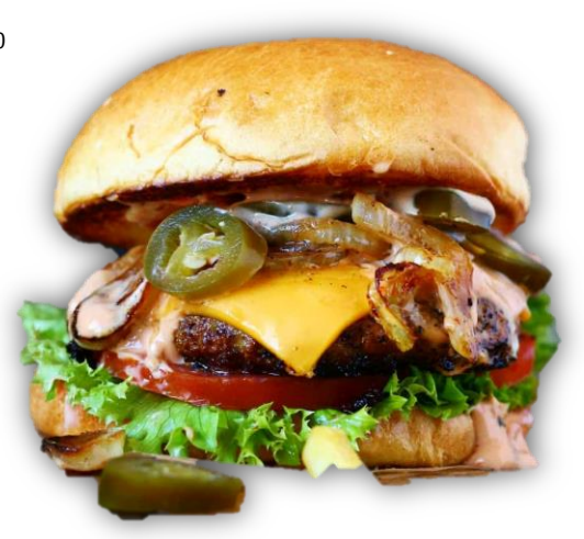
JALAPENO BEEF BURGER

SINGLE PATTY 100G (BRIOCHE) RS. 750 DOUBLE PATTY 200G (BRIOCHE) RS. 950