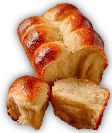
SOURDOUGH BRIOCHE RS. 1550

The New York Roll, originally called The Supreme, is a round and puff pastry topped with pastry cream and then iced. Highly addictive, this croissant with American sauce can be declined in several flavours: chocolate, pistachio, caramel