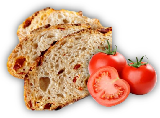
SOURDOUGH CHILI & TOMATOES: RS. 950

"Spicy and tangy bread made with chili and tomatoes, perfect for a bold kick"