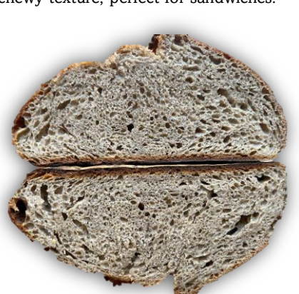
BUCKWHEAT RS. 1100

"Dense, nutty bread made with buckwheat flour and sourdough starter."