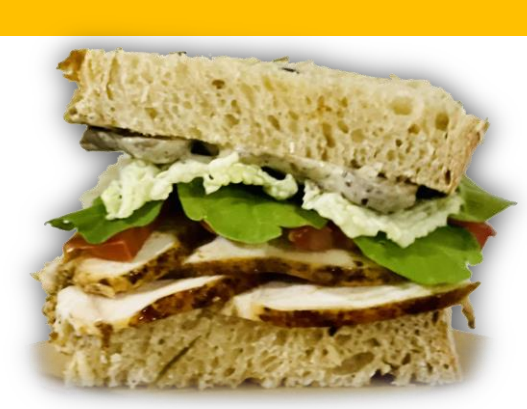
ROSEMARY & BLACK OLIVES ROASTED CHICKEN RS. 650

Shish taouk is a Middle Eastern dish of chicken skewers marinated in spices, yogurt, lemon and garlic. It's tender, juicy and flavourful,