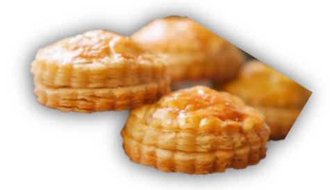
CHICKEN PATTIES RS. 700 (PACK OF 4) "Fluffy, crispy, tangy, sourdough patties for filling with chicken."

"Small, round, and flat sourdough breads with a tangy flavour and crispy exterior."