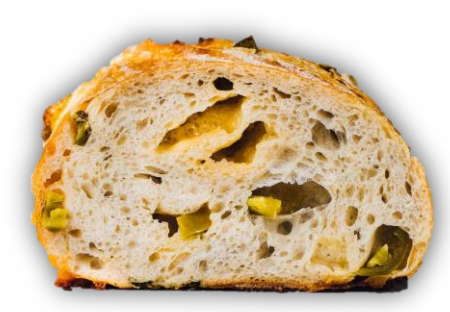
CHEESE & JALAPENO: RS. 950 "a savoury, slightly spicy, Golden brown & crispy on the outside with a soft, fluffy interior".