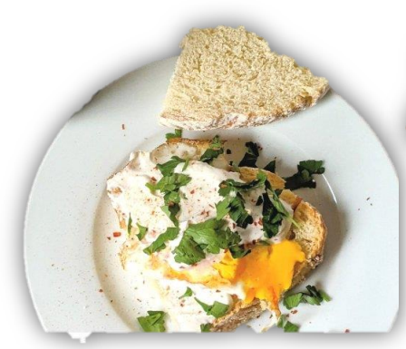
EGG SANDWICH LARGE RS.550

A unique buckwheat sandwich with roasted beef and mustard sauce