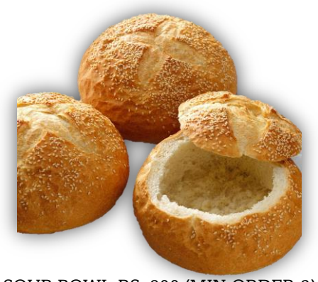
SOUP BOWL RS. 900 (MIN ORDER 2) "Crusty sourdough bread bowls perfect for serving soups and stews. Delicious and

"Italian Soft and chewy bread with a crispy crust and savory toppings, perfect for sharing."