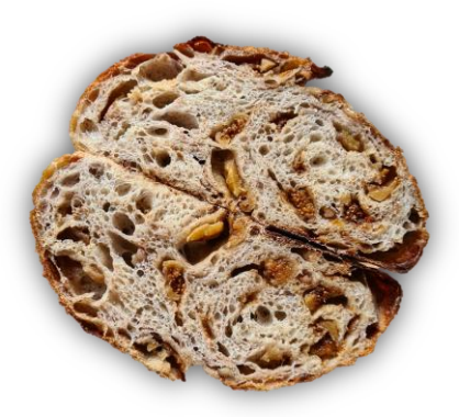
FIG & RAISINS RS. 950 "Sweet and nutty bread made with figs and walnuts, perfect for a gourmet treat."