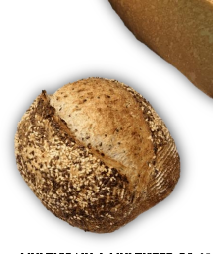
MULTIGRAIN & MULTISEED RS. 950 "Wholesome bread with a variety of grains, perfect for a healthy diet."