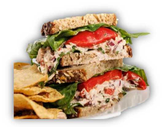
CHEESE AND JALAPENOS ROASTED CHICKEN SANDWICH LARGE RS. 650

chicken, crispy & salty crispy skin, rich and smooth sauces, all stuffed between two slices of soft bread with rosemary and black olives. Does that make your mouth water?