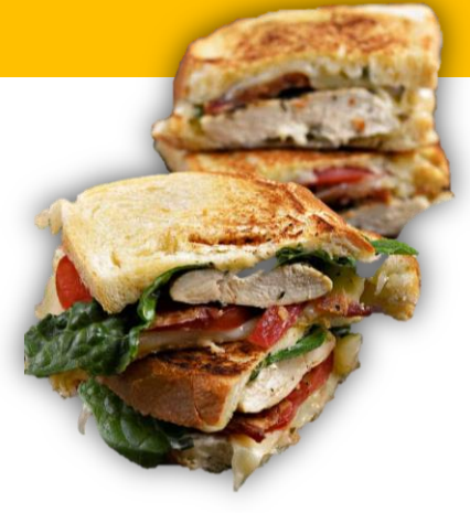
SHISH TAOUK CHICKEN SANDWICH LARGE RS. 650

"Tender & moist inside, crunchy & savoury chicken skin, flavourful filling of homemade sauce, sandwiched between 2 pieces of Multigrain Sourdough bread."