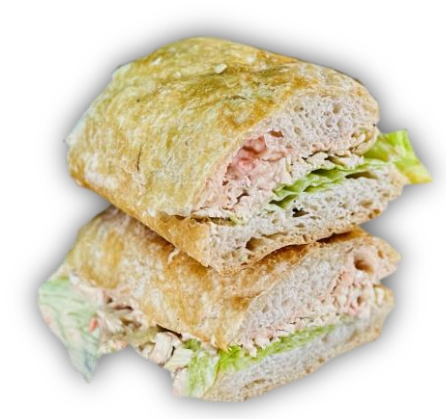
CIABATTA ROASTED CHICKEN SANDWICH LARGE RS. 700, XL RS. 850

Simple roasted and shredded chicken piled onto fresh bread that's been slathered with fresh vegies. Loaded with diced onions