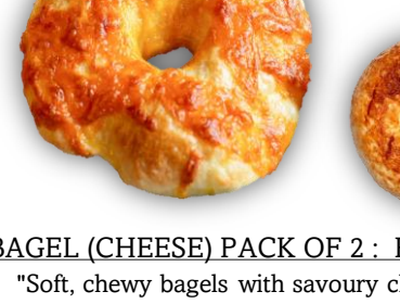
BAGEL (CHEESE) PACK OF 2: RS. 600 "Soft, chewy bagels with savoury cheese flavour. Perfect for sandwiches or toasting."

"Chewy bagels with savoury everything flavour. Perfect for sandwiches or toasting."