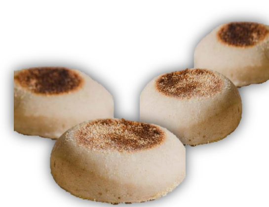
ENGLISH MUFFIN RS. 750 (PACK OF 4)

"Small, round, and flat sourdough breads with a tangy flavour and crispy exterior."