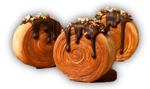
NEW YORK ROLLS RS. 1800 (PACK OF 3)

The New York Roll, originally called The Supreme, is a round and puff pastry topped with pastry cream and then iced. Highly addictive, this croissant with American sauce can be declined in several flavours: chocolate, pistachio, caramel