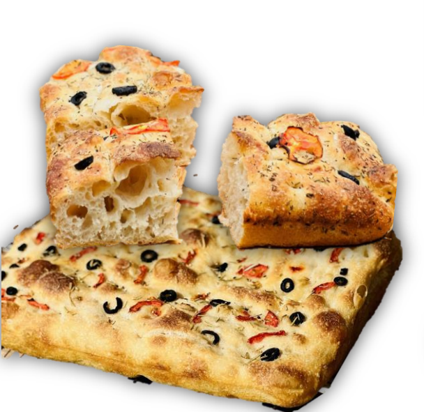
SOURDOUGH FOCACCIA RS. 1550

"It is a sweet, twisted bread filled with chocolate, cinnamon, and sugar. It's popular for dessert and goes well with coffee or tea."