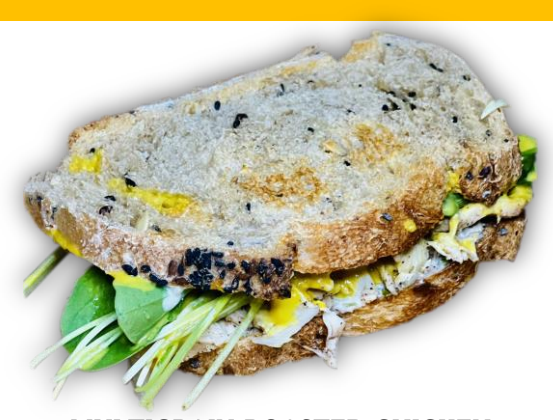
MULTIGRAIN ROASTED CHICKEN SANDWICH LARGE RS. 650

"Tender & moist inside, crunchy & savoury chicken skin, flavourful filling of homemade sauce, sandwiched between 2 pieces of Multigrain Sourdough bread."