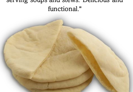
PITA RS. 550 (PACK OF 4) "Fluffy, tangy pockets of sourdough bread for filling with dips and fillings."