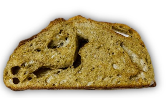
BUCKWHEAT ROASTED BEEF SANDWICH LARGE RS. 850

Enjoy a zesty sandwich with ciabatta bread stuffed with fiery chicken, crisp lettuce and a smear of sauce. Yummy!