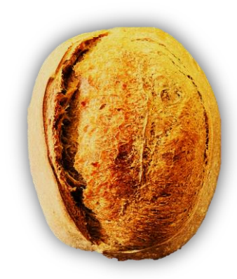
WHOLE WHEAT: RS. 850 "Hearty and wholesome made with whole wheat flour, a little dense, but perfect for a nutritious meal."