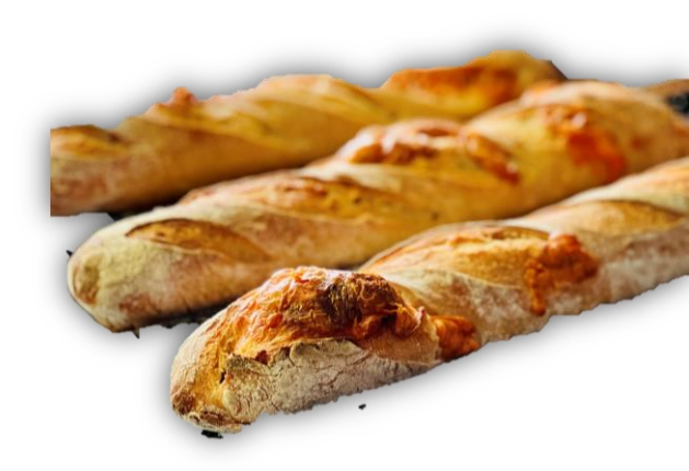
BAGUETTE WITH CRANBERRY & WALNUT RS. 600

A tangy baguette with cranberry & walnuts. Crunchy outside, chewy inside. Perfect for cheese or jam.