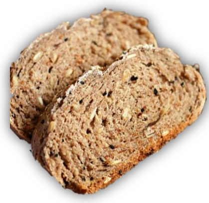
WHOLE WHEAT MULTISEED: RS. 950 "Hearty and wholesome made with whole wheat flour, a little dense, but perfect for a nutritious meal."