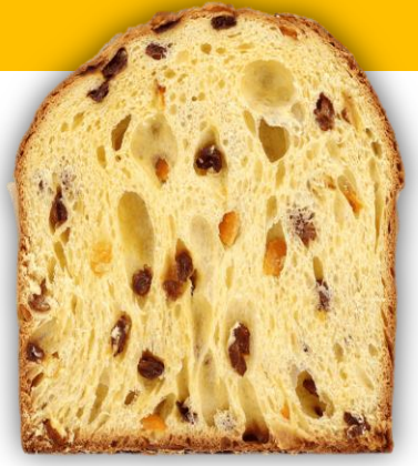
PANETTONE: RS. 5000 a traditional Italian sweet bread with a light, fluffy texture, enriched with butter, eggs, and dried fruit. It's often served during the holidays and has a sweet, tangy finish.