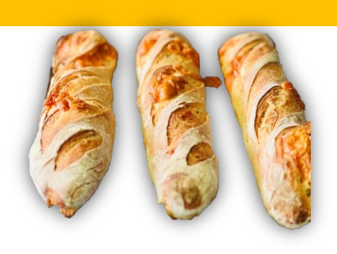
BAGUETTE WITH CHEESE & JALAPEÑO RS. 600 Cheese and jalapeño baguette is bread with cheese and peppers inside. Slice it with garlic butter until crispy and melty. Eat it anytime.