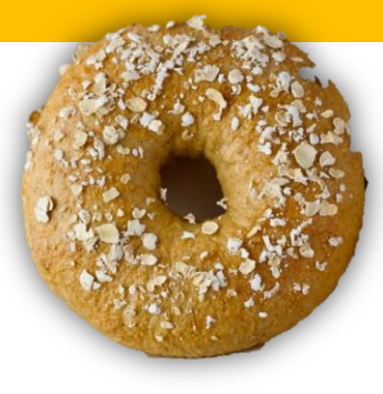
BAGEL OAT MEAL (PACK OF 2): RS. 600

"Chewy, dense bagels with a nutty oatmeal seasoning & flavour. Perfect for toasting and topping."