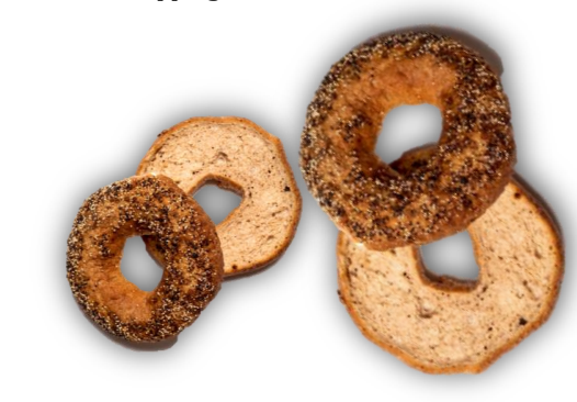
EVERYTHING BAGELS PACK OF 2: RS. 600

"Chewy, dense bagels with a nutty oatmeal seasoning & flavour. Perfect for toasting and topping."